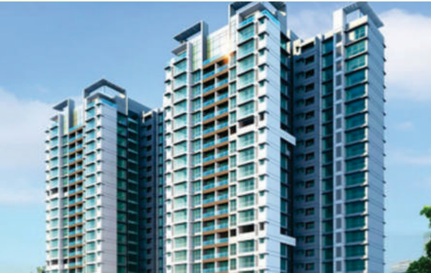
NERO: Bandra East