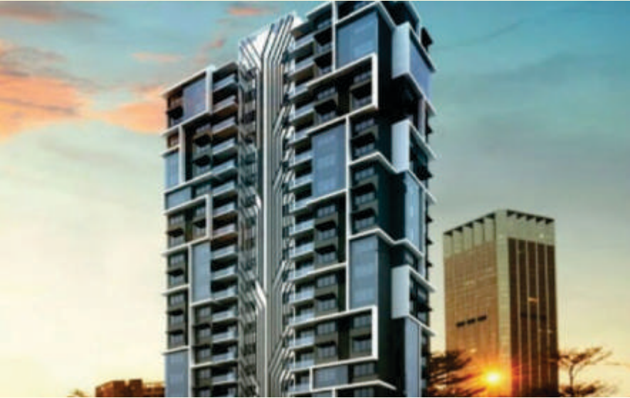
LUXOR: Goregaon West