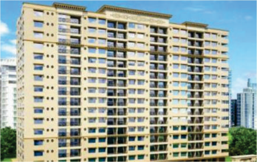
VEDA: Andheri East